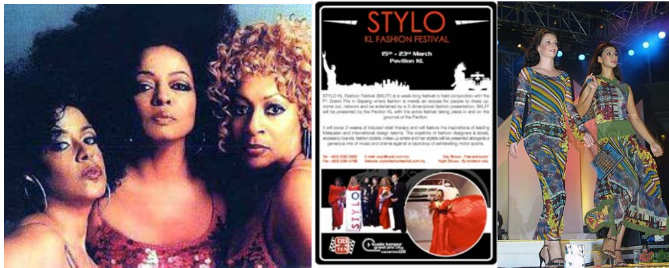
Two members of The Supremes (above), Scherrie Payne and Lynda Laurence will help launch the Stylo KL Fashion Festival

A week-long fashion extravaganza showcasing international and local creations and officially launched by members of the Supremes.